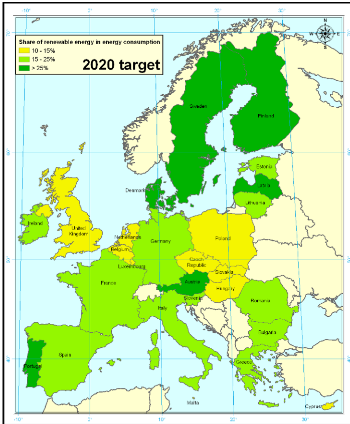
Figure 1. Target for the share of renewables in energy consumption in 2020.

the targets cost effectively (Directive 2009/28/EC). In the medium-long-term, the EU's 20-20-20 strategy calls for “an energy system with a diversity of non-fossil fuel supplies, flexible infrastructures and capacities for demand management [that] will be very different in energy security terms than today's system.” In the short to medium term, effective provisions for preventing and dealing with supply crises must be made, in order to diminish the vulnerability to energy supply shocks (Figure 1).