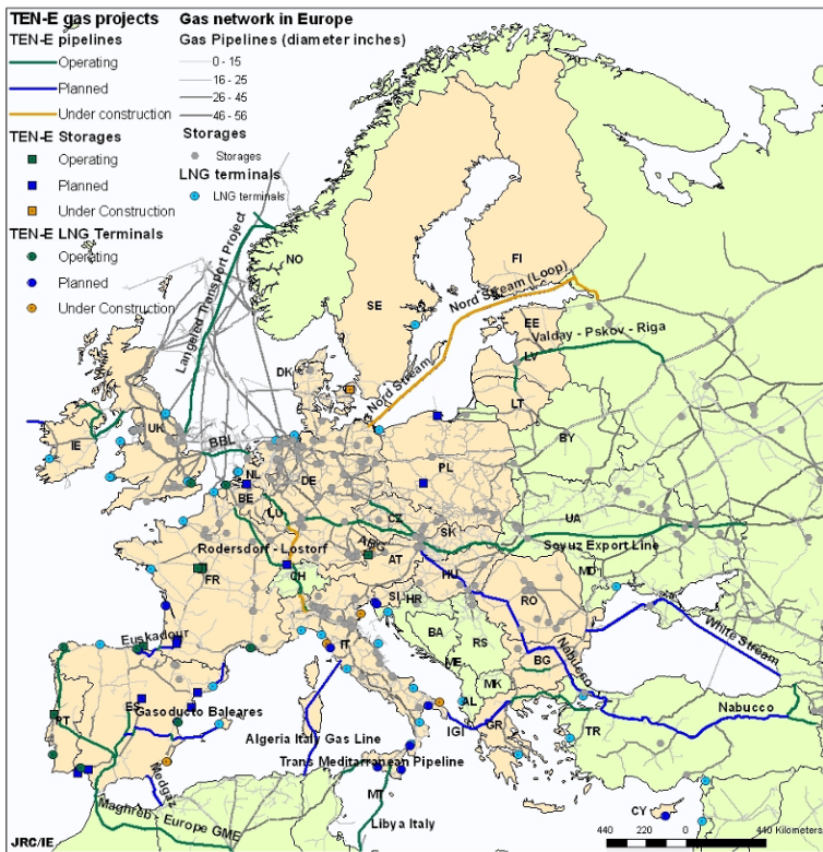
Figure 2. Existing gas network in Europe and Trans-European gas projects.

unconventional. In Europe, countries with large potential shale gas resources are Austria, France, Germany, Hungary, Poland and the UK. The first interdisciplinary shale gas initiative in Europe (GASH) was launched in 2009, focusing primarily on Denmark and Germany. According to estimates of Polish Ministry of Environment, Polish shale gas reserves alone could amount to 1.4–3 tcm, however no shale gas field has been documented yet. Despite its prospects, shale gas extraction has raised concerns about environmentally sound drilling and the protection of groundwater and surface water. Also, the land leasing regulations in Europe, as opposed to those in the United States, seem to be less favourable for shale gas development.